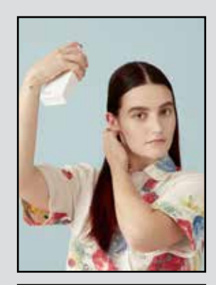
miss malleable flexible hair spray