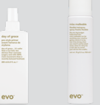
day of grace pre-style primer